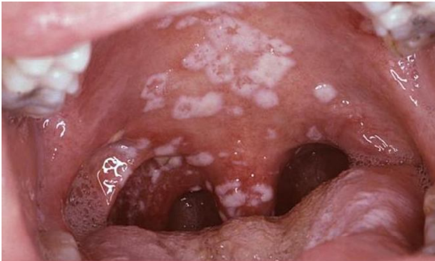
Figure 1 Oropharyngeal candidiasis