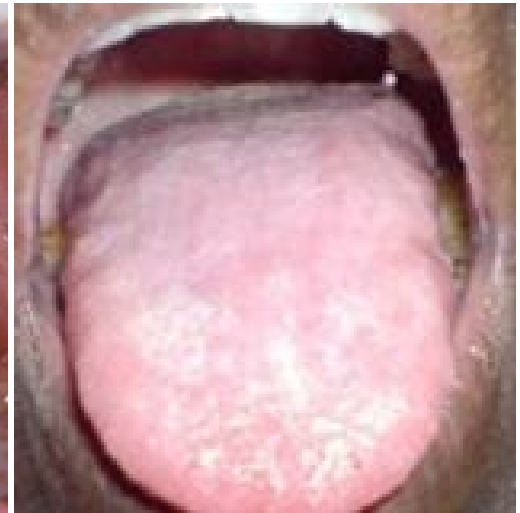
Figure 2 Mucosal Candidiasis